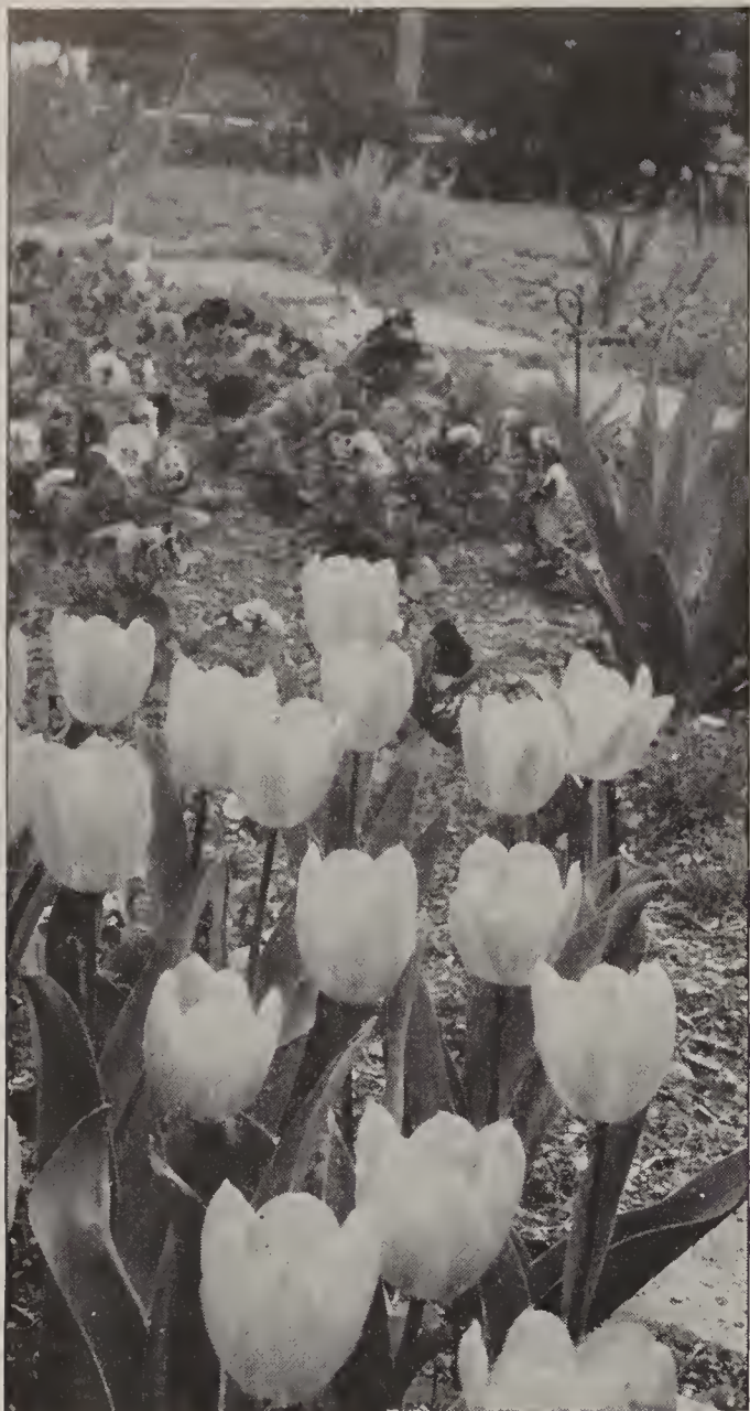
Single Early Tulip, Sarah Bernhardt